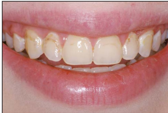
Figure 1. Preoperative smile. Note the significant amount of demineralized teeth, orthodontic bracket scars, and poor gingival health.

Following orthodontic treatment, a 15-year-old female presented for evaluation and treatment of the demineralized lesions present on most of her teeth (Figure 1). The patient's chief complaint was the unaesthetic appearance created by the lesions around and beneath the orthodontic brackets she had worn. After a thorough clinical examination was performed and radiographs were taken, a treatment plan was formed. Using a