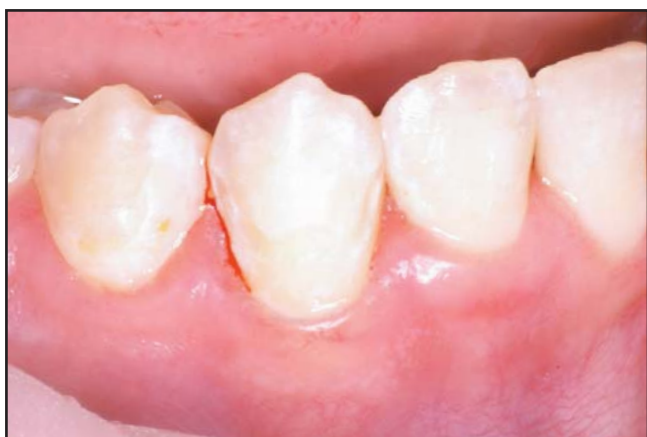
Figure 5. Preparation of tooth #27(43) showing subgingival extension of the preparation, which will require isolation for restoration.

the final margins should be, the prepared and etched tooth structure was coated with a bonding agent. This adhesive thoroughly wet the dentin and would allow the composite resin to penetrate into the tooth; it would also remove any excess intertubular fluids and create the hybridized zone. After thinning the bonding agent with a steady stream of dry air, the entire bonded surface was light cured for 30 seconds. The appropriate dentin-shaded resin (A1) was placed into the deep dentin portions of the preparations and polymerized. The final layer of enamel-shaded composite resin (T1) was placed to create the full contour and the surface translucency of the restoration. Each tooth involved in this single appointment, direct procedure was independently isolated and