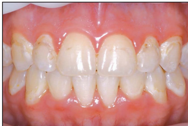
Figure 2. Tissue edema and erythema remain around the gingival aspect of the maxillary anterior teeth after two months of increased home hygiene and MI paste use for the demineralized areas.

minimally invasive approach, the clinician would first prescribe the use of a remineralization toothpaste to repair the demineralized enamel. 11 Should this manner of treatment prove insufficient to produce the required outcome, additional minimally invasive procedures would be undertaken.