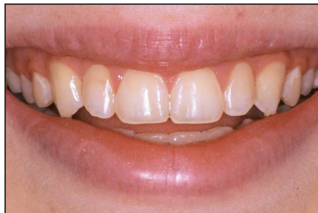
Figure 10. Two-week follow up. Gingival health has been restored.

Air abrasion is an effective process that the clinician can use to remove demineralized enamel and the underlying carious dentin. 14,15 In the author's experience, air abrasion also creates an ideal surface for achieving excellent bond strengths to both dentin and enamel. 12,13 The various air abrasion units currently on the market use