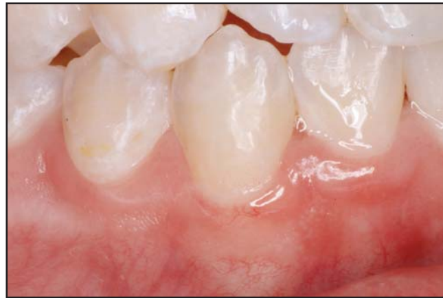
Figure 12. Tissue health at two weeks is markedly improved.

aluminous oxide powder and a water stream to selectively remove demineralized enamel and carious dentin. Very often, teeth can be prepared, as described in the aforementioned adhesive bonding procedure, via air abrasion without the need for anesthesia, especially when used with the water spray. The simultaneous delivery of the aluminous oxide and warm water keeps the scatter of aluminous oxide powder to a minimum.