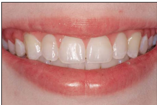
Figure 9. One-week follow up of the patient's smile. The gingival health has improved.

restored utilizing these steps. Bands were placed simultaneously on each independent tooth and then removed simultaneously as well.