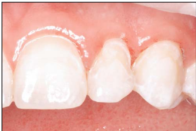
Figure 4. Preparations of teeth #9 through #11(23) showing minor tissue hemorrhaging. Teeth #10(22) and #11 show the interproximal extension of the preparation.

damage of the demineralization and to prevent the need for future restorations. Follow-up appointments revealed that many of these demineralized areas were adjacent to tissues that did not respond well to the patient's home care regimen.