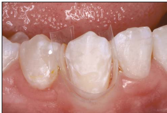
Figure 6. Individual isolation of tooth #27 utilizing a custom contoured Mylar strip secured to the tooth and gingiva with unfilled bond resin.

Once the matrix form was in place, the bonding process could proceed. A 37% phosphoric acid etchant was placed on the prepared lesion for 15 seconds, 13 rinsed for 20 seconds, and lightly air dried. The etch was placed on the enamel first and then spread onto the dentin so that the dentin exposure time is far less. Rinsing time ensures a clean and neutralized surface. Leaving the bonding agent (ie, PQ1, Ultradent, South Jordan, UT) on for 30 seconds assures that there is an adequate hybrid zone. This allows the proper penetration of the resin to occur. With the area matrixed exactly where