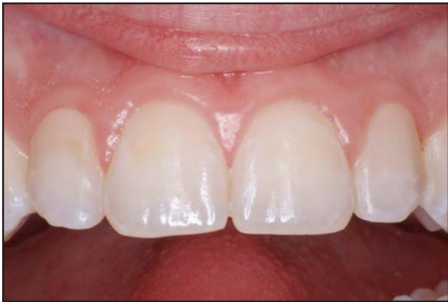
Figure 11. Gingival tissue health at two weeks is remarkably better.