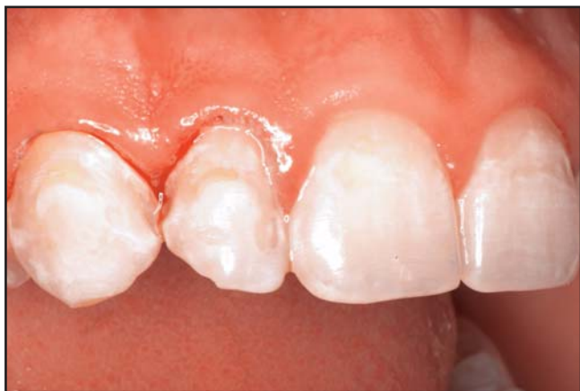
Figure 3. Air abrasion preparations on teeth #6(13) through #9(21) show gingival hemorrhaging in the unhealthy gum tissues. Lesions on teeth #6 and #7 extend interproximally.