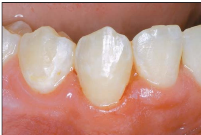
Figure 8. Immediate postoperation of matrixed tooth #27 showing minimal tissue trauma and a life-like match of the emergence profile, tooth contour, and color.